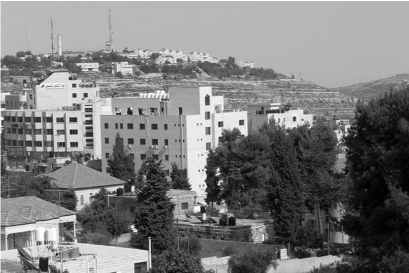
Figure 7.3. Ramallah with Psagot settlement and its broadcasting and cellular towers in the background.

Jawwal's coverage was understandably limited when it first launched, particularly in the West Bank. The fact that the West Bank's topography is hilly certainly did not help—Jawwal would have to install more towers in more places in order to reach valleys and hilltops and thereby further increase its operating costs. Jawwal was also constrained by the strength of signals. In most of the areas outside of downtown Ramallah, for example, Jawwal users simply had no signal. Over time, subscribers found it surprising that their lack of "bars" didn't increase. What those subscribers ought to have realized was that Jawwal had to work around technical limitations imposed not only by spectrum frequency and signal strength but also by the location of settlements, outposts, and Israeli cellular towers. From many parts of Ramallah one simply had to look up to the surrounding hills to understand why Jawwal's signals never arrived (see figure 7.3).