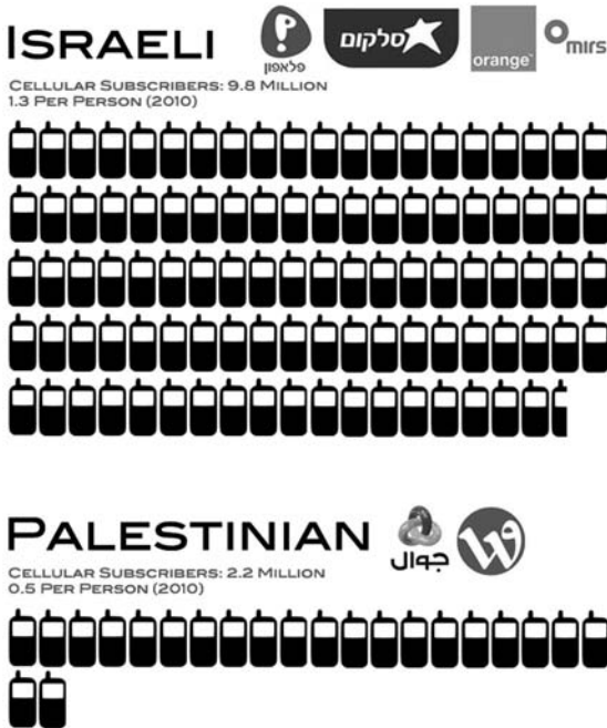
Figure 7.4. Cellular subscribers on Israeli and Palestinian networks. Graphic by author.

allocation (see figure 7.5), they can handle more subscribers and simultaneous calls per cell. In other words, Israeli signals do not stop at the territorial boundaries imposed on Palestinians, but rupture them, reaching wider ranges before signals fade or are lost. A contradiction emerges about technical borders and to what extent they ought to follow or trespass territorial borders, and for whom.