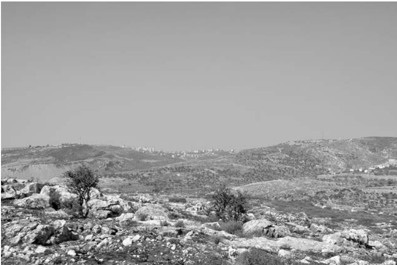
Figure 7.2. View of Ramallah from Migron. Two other settlements are on the two hills on both sides of Ramallah; a Palestinian town is in the foreground.

The four Israeli cellular providers are awarded spectrum from the Israeli Ministry of Communication. None of the providers has faced any difficulty in obtaining licenses or spectrum from the MoC. Pelephone has 46MhZ of spectrum, Cellcom 27MhZ, and Orange 20.4MhZ (MIRS, being the military’s official and exclusive operator, does not make its spectrum allocation publically known). 13 The four companies provide all of the latest technologies to their subscribers: 4G, GPS tracking, online banking, and so on. Each provider is awarded its own area code(s), and providers must establish “bilateral agreements” (in corporate-speak) to connect different area codes and allow users to roam on