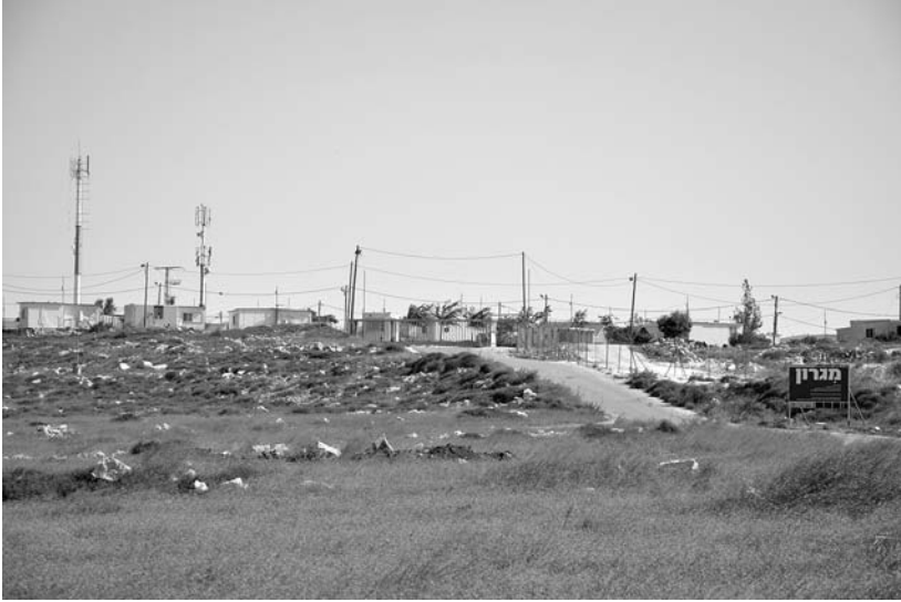
Figure 7.1. Migron and its cellular towers.

In 1986 the national telecommunications company Bezeq launched its cellular subsidiary, Pelephone, which offered mobile service inside Israel and to Israeli settlements in the West Bank and the Gaza Strip. Since market liberalization in 1994 another three private cellular companies provide service: Cellcom, which launched in 1994, MIRS in 1998, and Orange in 1999. 9 The four providers contend that they operate in the Palestinian Territories so as to provide service to settlers, Israelis traveling on bypass roads, and, of course, the military. They generally have the liberty to install their equipment wherever they want inside the Territories, although the majority have been established inside settlements, military zones, and along bypass roads. 10 This means that Israeli infrastructure more or less parallels Israel's territorial presence in the West Bank (since disengagement from Gaza in 2005, Israeli firms no longer have equipment inside the strip).